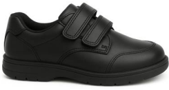
Velcro Fastening Shoe Generic | Boys Sizes: 3-8