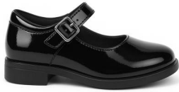
Mary Jane Generic | Girls Sizes: 2-7