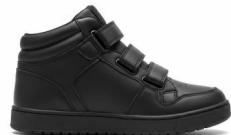
High-top Trainer (Velcro) Generic | Boys Sizes: 3-8