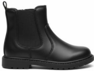
Zip Chelsea Boot Generic | Girls Sizes: 3-8