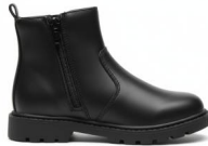
Zip Chelsea Boot Generic | Boys Sizes: 3-8