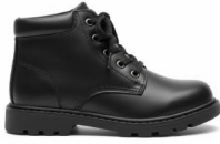
Lace-up Boot Generic | Boys Sizes: 3-8