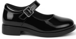
Mary Jane Generic | Girls Sizes: 2-7