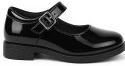
Mary Jane Generic | Girls Sizes: 2-7