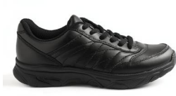
Lace Up Trainer Generic | Boys Sizes: 3-8