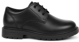
Derby Shoe Generic | Boys Sizes: 3-8