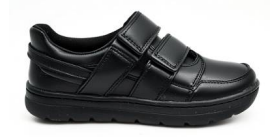
Velcro Trainer Generic | Boys Sizes: 3-8