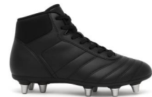
Rugby Boots Generic | Boys Sizes: 3-8