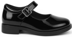
Mary Jane Generic | Girls Sizes: 2-7