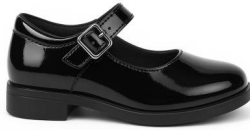
Mary Jane Generic | Girls Sizes: 2-7