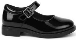
Mary Jane Generic | Girls Sizes: 2-7