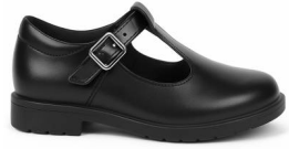
T-Bar Shoe Generic | Girls Sizes: 1-13