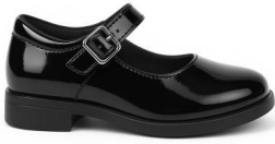
Mary Jane Generic | Girls Sizes: 2-7