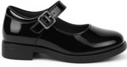
Mary Jane Generic | Girls Sizes: 2-7