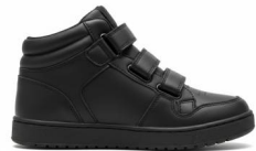
High-top Trainer (Velcro) Generic | Boys Sizes: 3-8