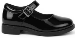
Mary Jane Generic | Girls Sizes: 2-7