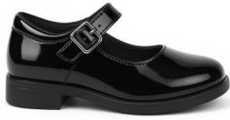
Mary Jane Generic | Girls Sizes: 2-7