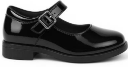
Mary Jane Generic | Girls Sizes: 2-7